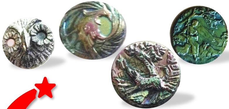
A Whack of Fascinating Buttons Too!